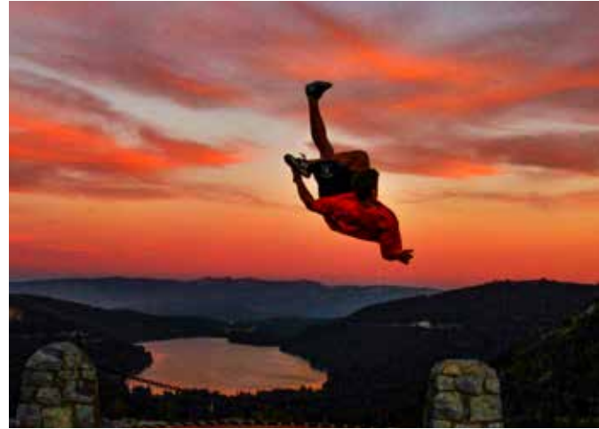
Andrew Elder, Donner Lake

travel schedule were super heavy. I did consulting for a few years, but the national travel, four or more days per week, was too much,” she says. By then, she had small children and wasn’t