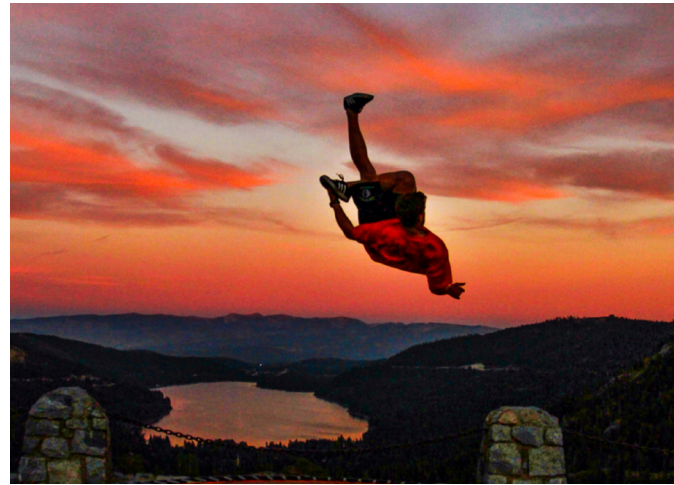
Andrew Elder, Donner Lake

travel schedule were super heavy. I did consulting for a few years, but the national travel, four or more days per week, was too much,” she says. By then, she had small children and wasn’t